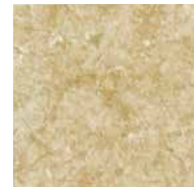
TIERRA BAYITA C521-19