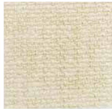
WINTER MIST 2121-14