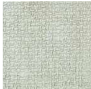
SEA MIST 2121-97