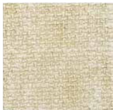
DESERT SHORE 2121-17