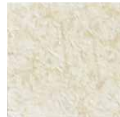
O'KEEFE WHITE C521-03